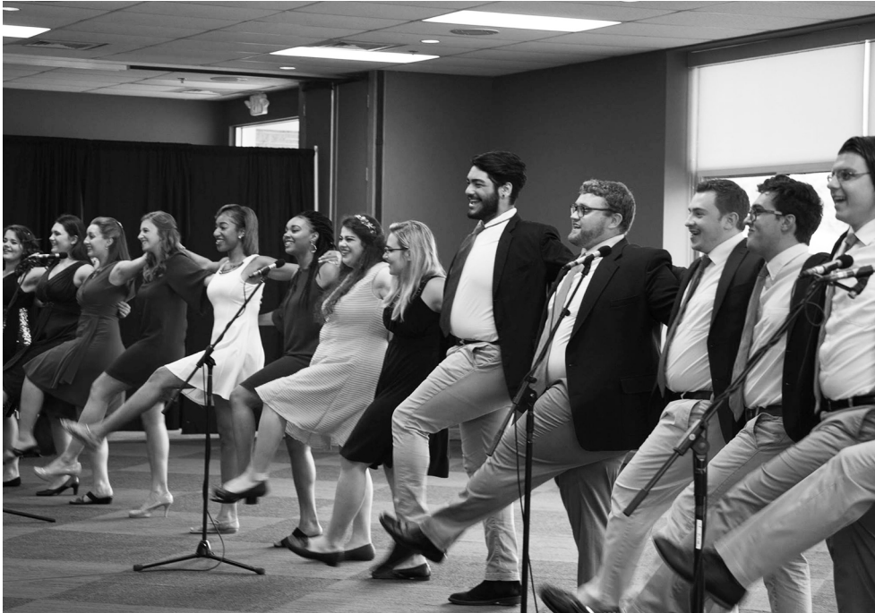
The Lake Junaluska Singers will give two Lakeshore Goes Broadway performances on July 17 and 18