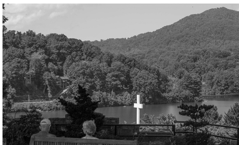
A couple enjoys the view of the Lake Junaluska Cross at Inspiration Point.

"I think the yoga is wonderful," Polk said when asked about this new activity happening at Inspiration Point. "I can't think of anything more appropriate. My concept of religion is very broad. It takes in your whole life and your whole body and everything about you."