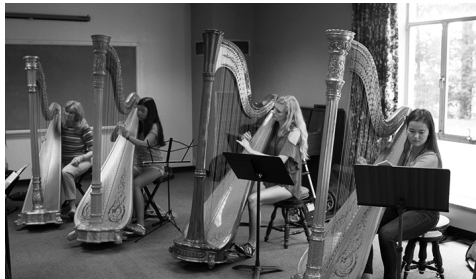
Young harpists from the 2017 Summer Harp Academy at Lake Junaluska work on their skills.