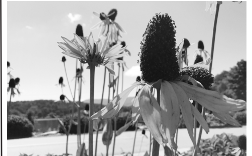
Find the tall and sunny black-eyed Susan outside the Bethea Welcome Center.